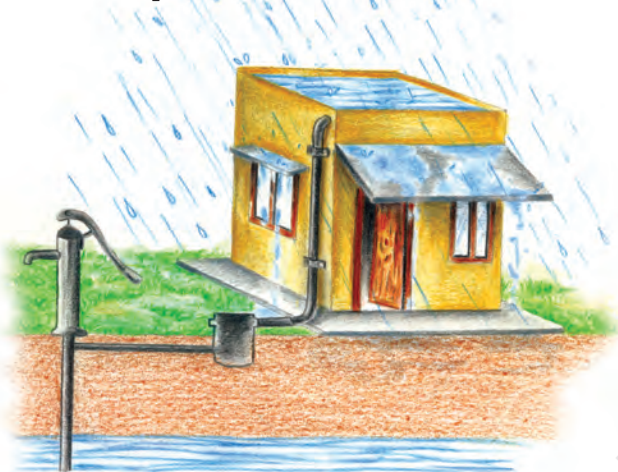
(a) Recharge through Hand Pump

system and were built inside the main house or the courtyard. They were connected to the sloping roofs of the houses through a pipe. Rain falling on the rooftops would travel down the pipe and was stored in these underground 'tankas'. The first spell of rain was usually not collected as this would clean the roofs and the pipes. The rainwater from the subsequent showers was then collected.