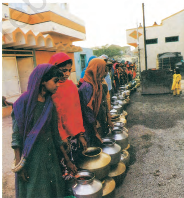
Fig. 3.1: Water Scarcity

एक ओर इजराइल जैसे 25 सेमी. औसत वार्षिक वर्षा वाले देश में जल का कोई अभाव नहीं है तो दूसरी ओर 114 सेमी. औसत वार्षिक वर्षा वाले हमारे देश में प्रति वर्ष किसी भाग में सूखा अवश्य पड़ता है। देश में जल की उपलब्धता और उसके स्वरूप के अनुसार समुचित जलप्रबंधन न होने के कारण ही वर्षा का जल नदी-नालों में तेजी से बहकर समुद्र में चला जाता है जिससे वर्षा के बाद के लगभग नौ महीने देश के लिए पानी की कमी के होते हैं। ये ही मूल कारण हैं देश में जलीय अभाव के, जिसे हम उचित प्रबंधन के द्वारा ही नियंत्रित कर सकते हैं।