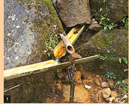
Picture 1: Bamboo pipes are used to divert perennial springs on the hilltops to the lower reaches by gravity.

In Meghalaya, a 200-year-old system of tapping stream and spring water by using bamboo pipes, is prevalent. About 18-20 litres of water enters the bamboo pipe system, gets transported over hundreds of metres, and finally reduces to 20-80 drops per minute at the site of the plant.