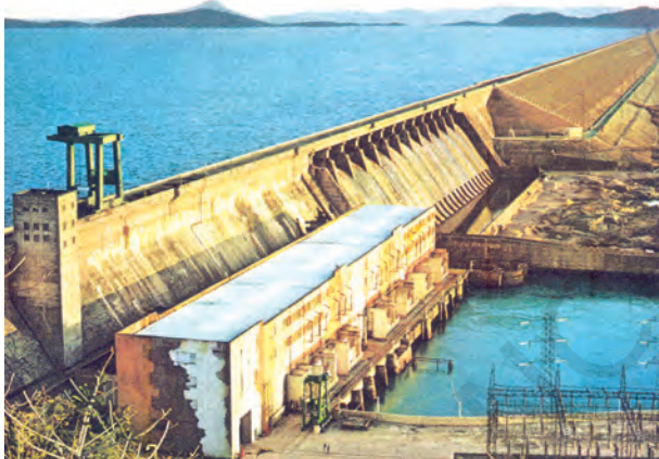
Fig. 3.2: Hirakud Dam

What are dams and how do they help us in conserving and managing water? Dams were traditionally built to impound rivers and rainwater that could be used later to irrigate agricultural fields. Today, dams are built not just for irrigation but for electricity generation, water supply for domestic and industrial uses, flood control, recreation, inland navigation and fish breeding. Hence, dams are now referred to as multi-purpose projects where the many uses of the impounded water are integrated with one another. For example, in the Sutluj-Beas river basin, the Bhakra – Nangal project water is being used both for hydel power production and irrigation. Similarly, the Hirakud project in the Mahanadi basin integrates conservation of water with flood control.