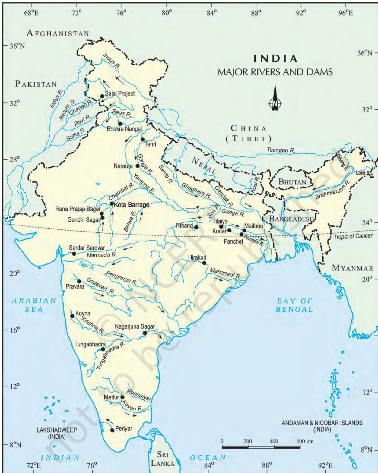
India: Major Rivers and Dams