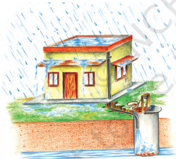
(b) Recharge through Abandoned Dugwell