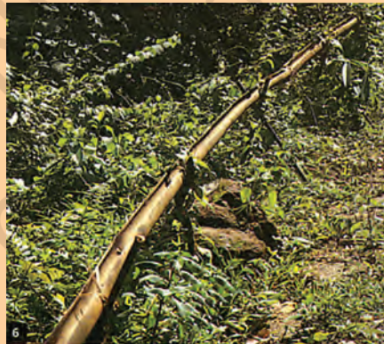
Picture 5 and 6: Reduced channel sections and diversion units are used at the last stage of water application. The last channel section enables water to be dropped near the roots of the plant.